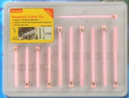
50 PCS Magnetic Cable Tie

Germany patent no. 20 2005 002 167.9 U.S.A patent pending no. 11/048,241 TAIWAN patent pending no. 094101219 CHINA patent pending no. 200520039234.3